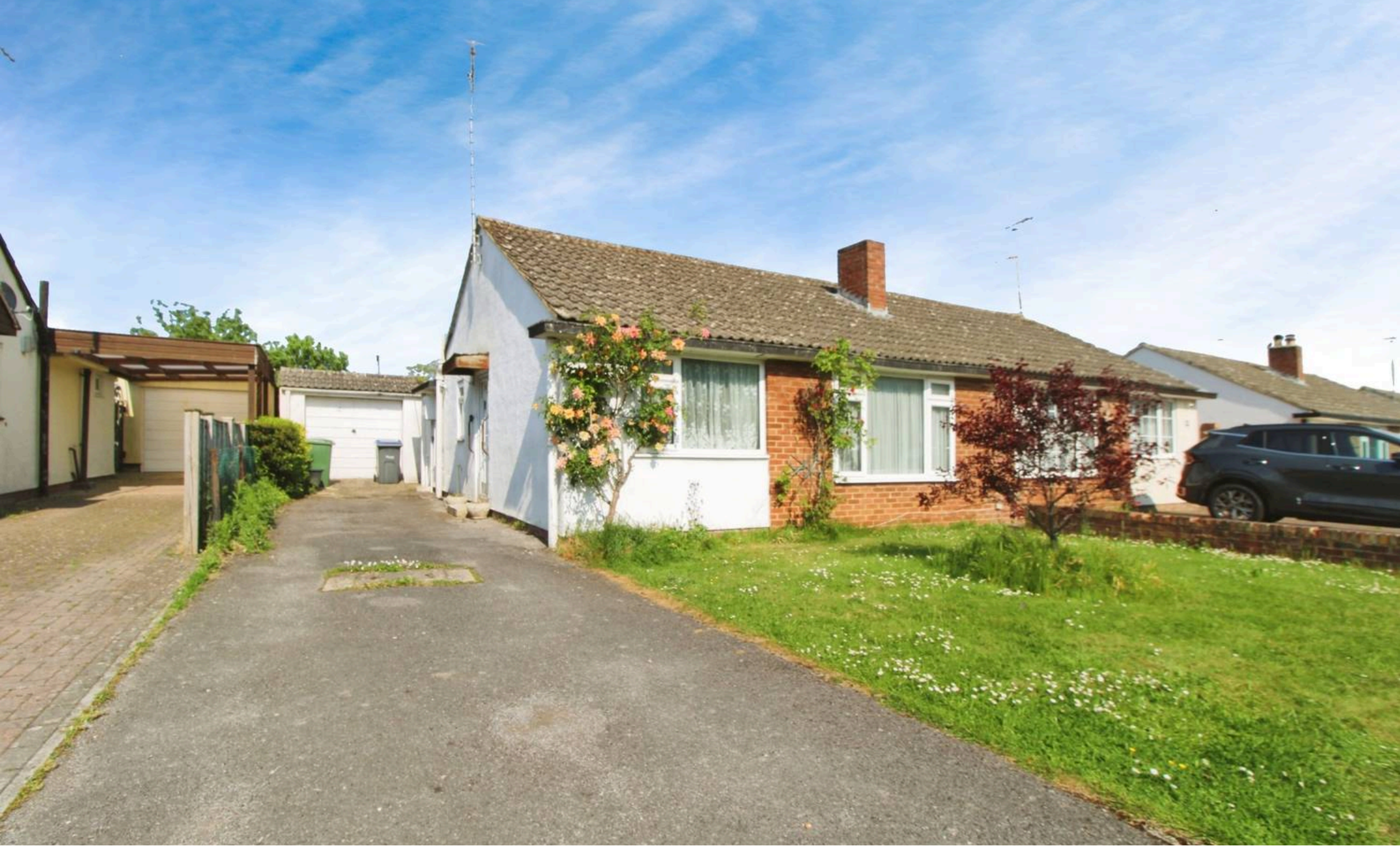
Pauls Croft, Cricklade – SN6 6AL Swindon

Guide Price £275,000 mcfarlane property.com