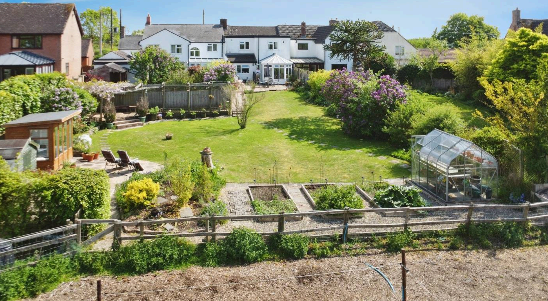
Clover Cottage Purton Stoke – SN5 4JG Wiltshire

Guide Price £450,000 mcfarlane property.com