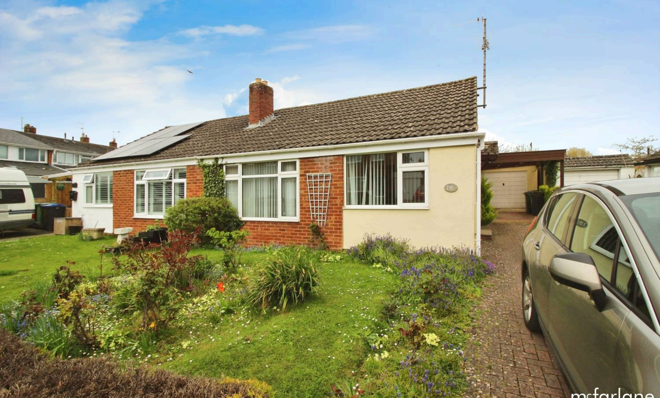
Pauls Croft, Cricklade – SN6 6AL Wiltshire

Guide Price £295,000 mcfarlane property.com