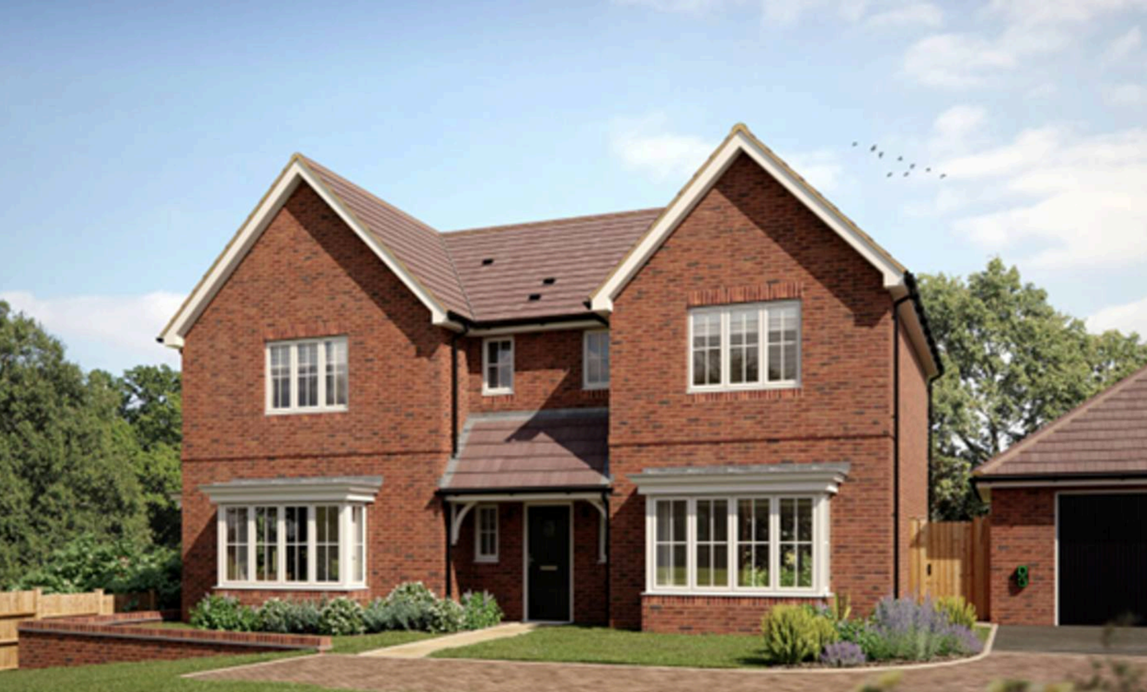
The Yew, Restrop Road, Purton Swindon