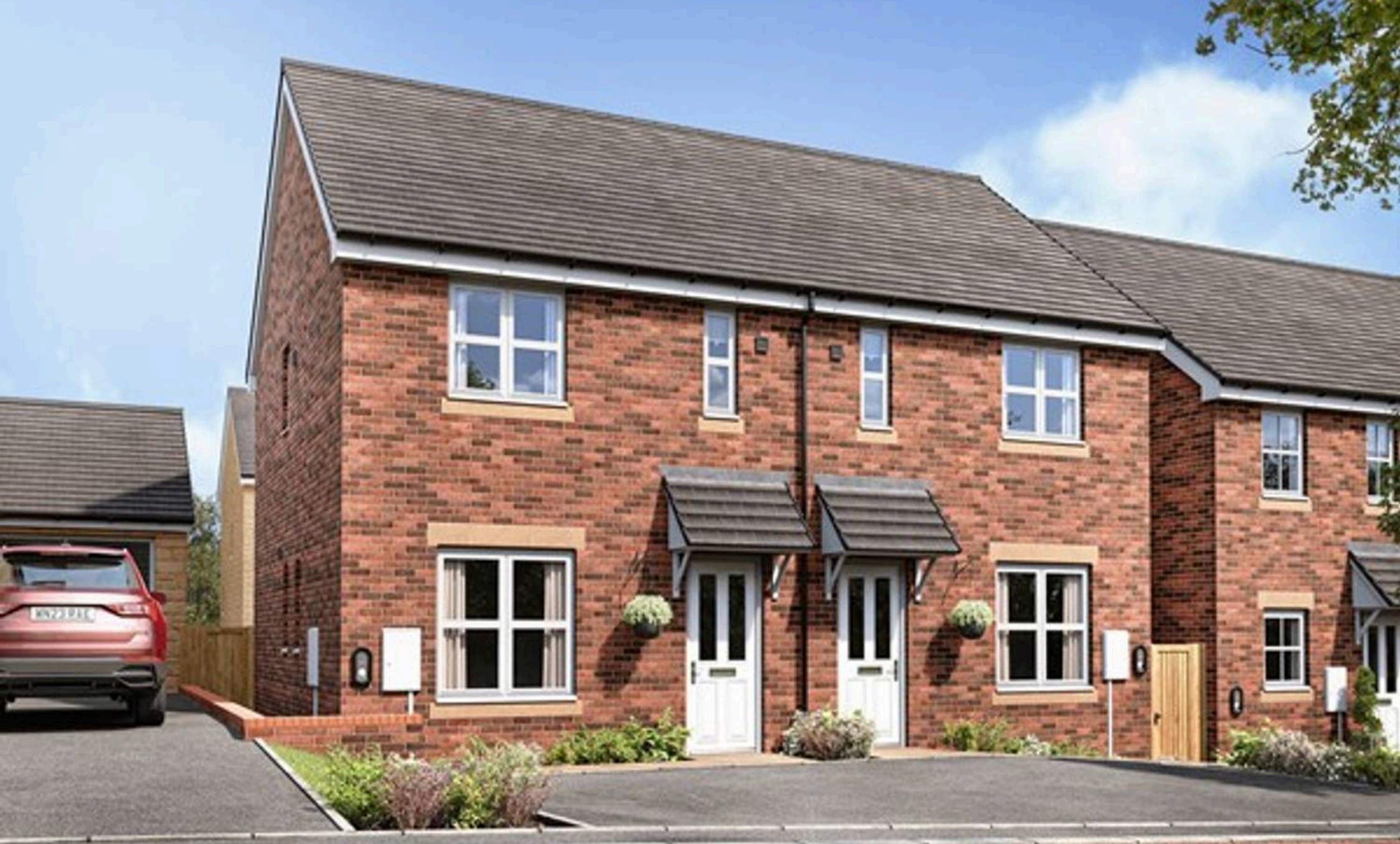
Danbury, Sillars Green, Tetbury Road Malmesbury