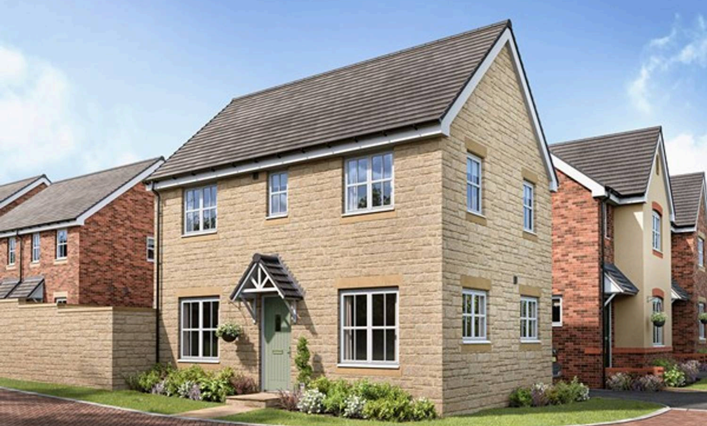
Barnwood, Sillars Green, Tetbury Road Malmesbury