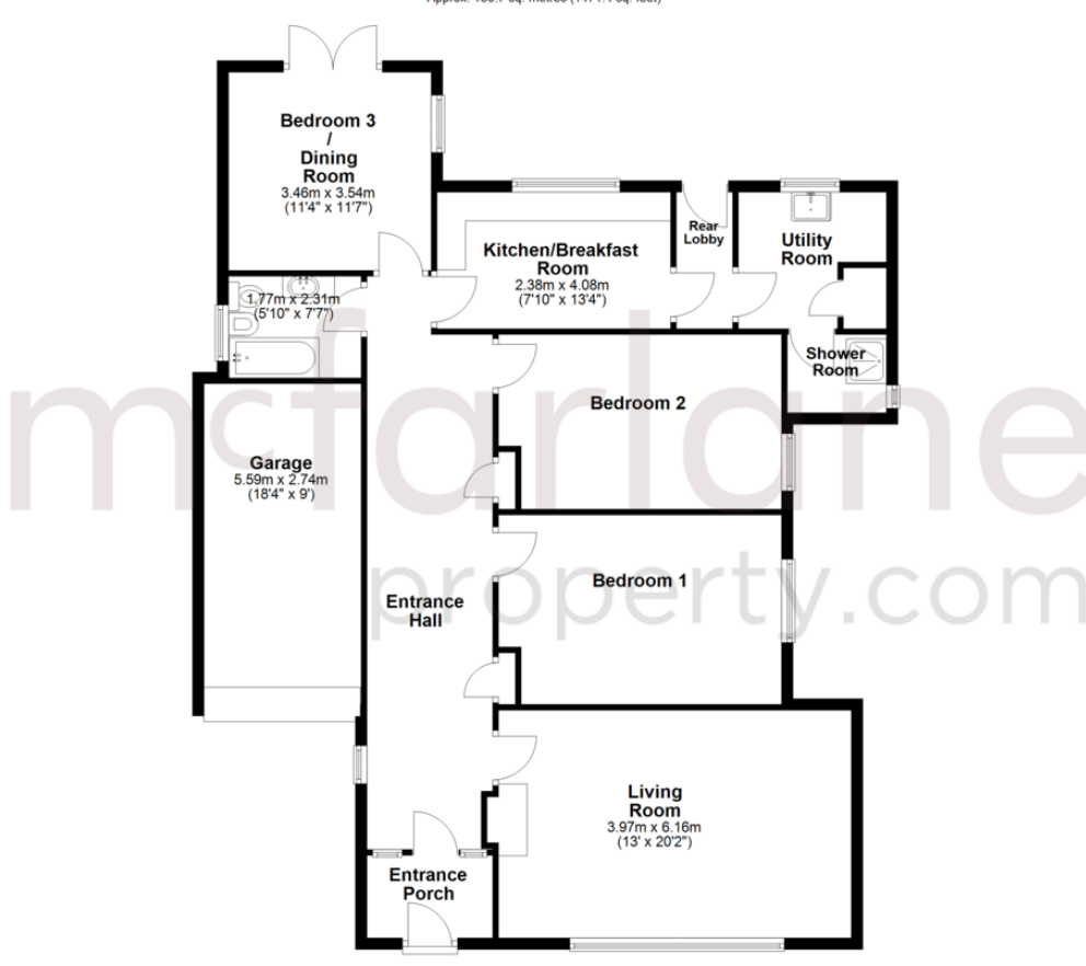
Total area: approx. 136.7 sq. metres (1471.4 sq. feet)

Approx. 136.7 sq. metres (1471.4 sq. feet)