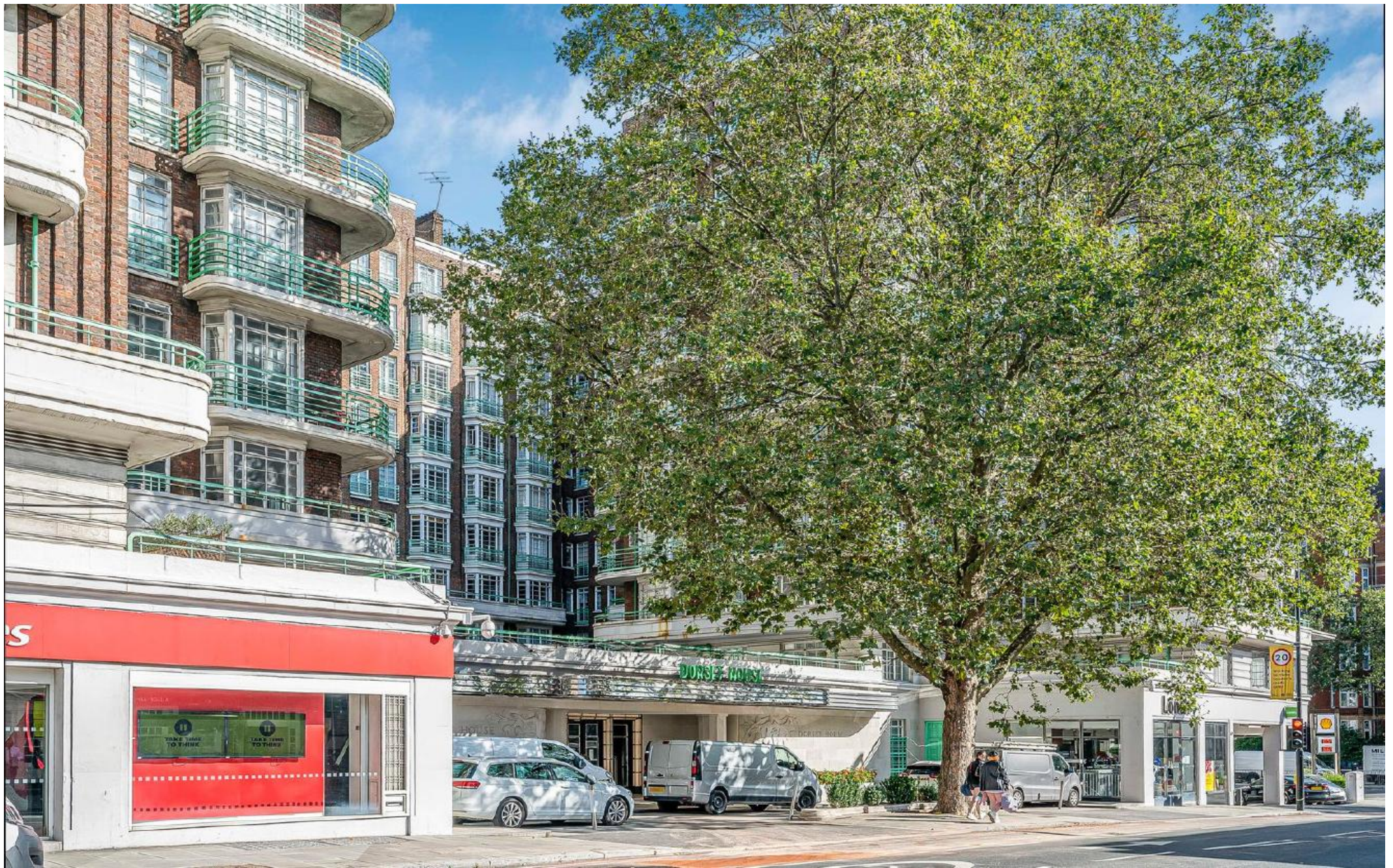
Gloucester Place, London, NW1