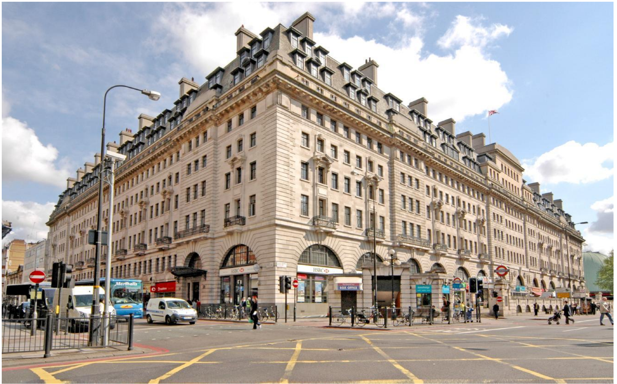
Baker Street, Marylebone, NW1