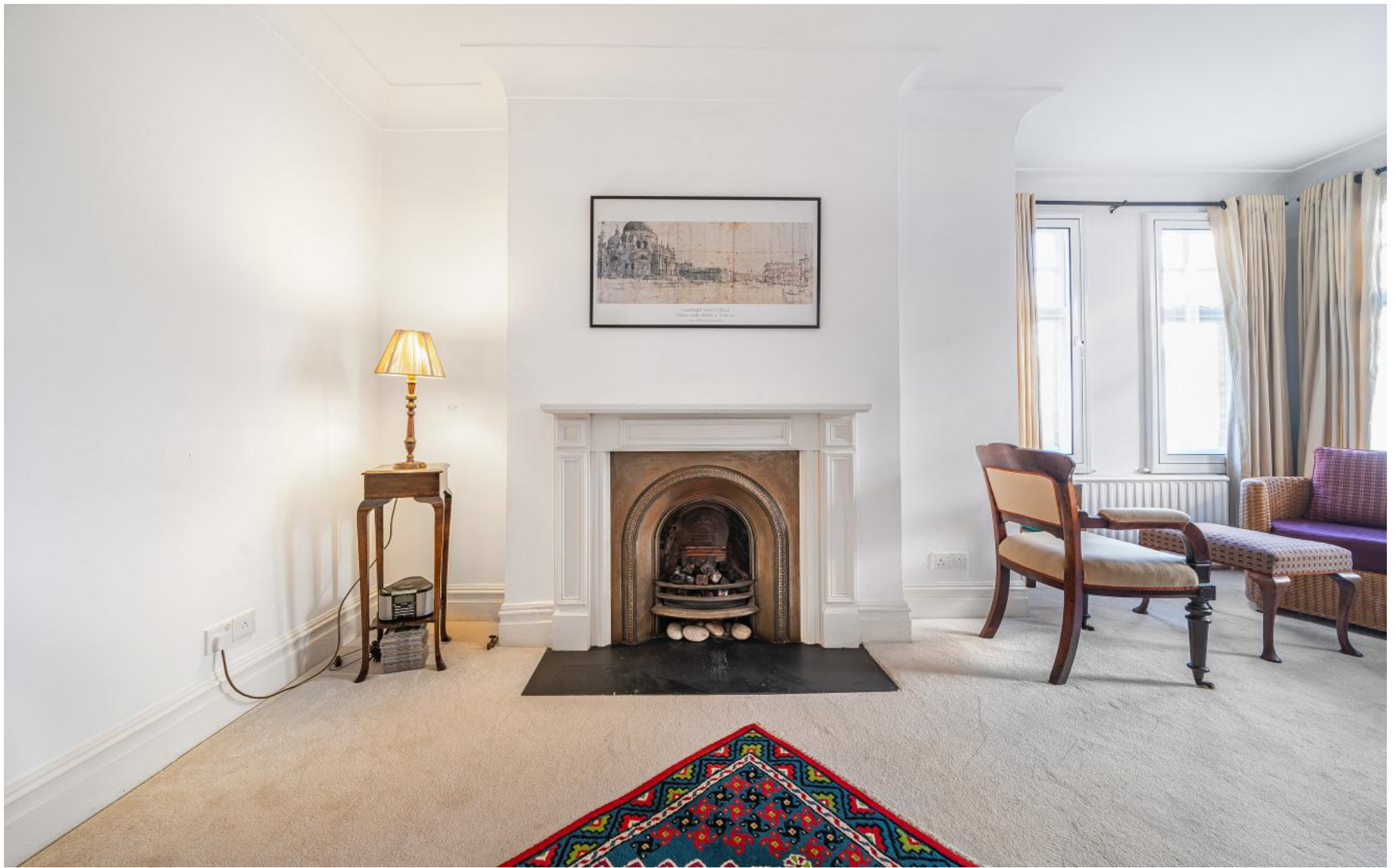
Hamlet Gardens, Hammersmith, W6