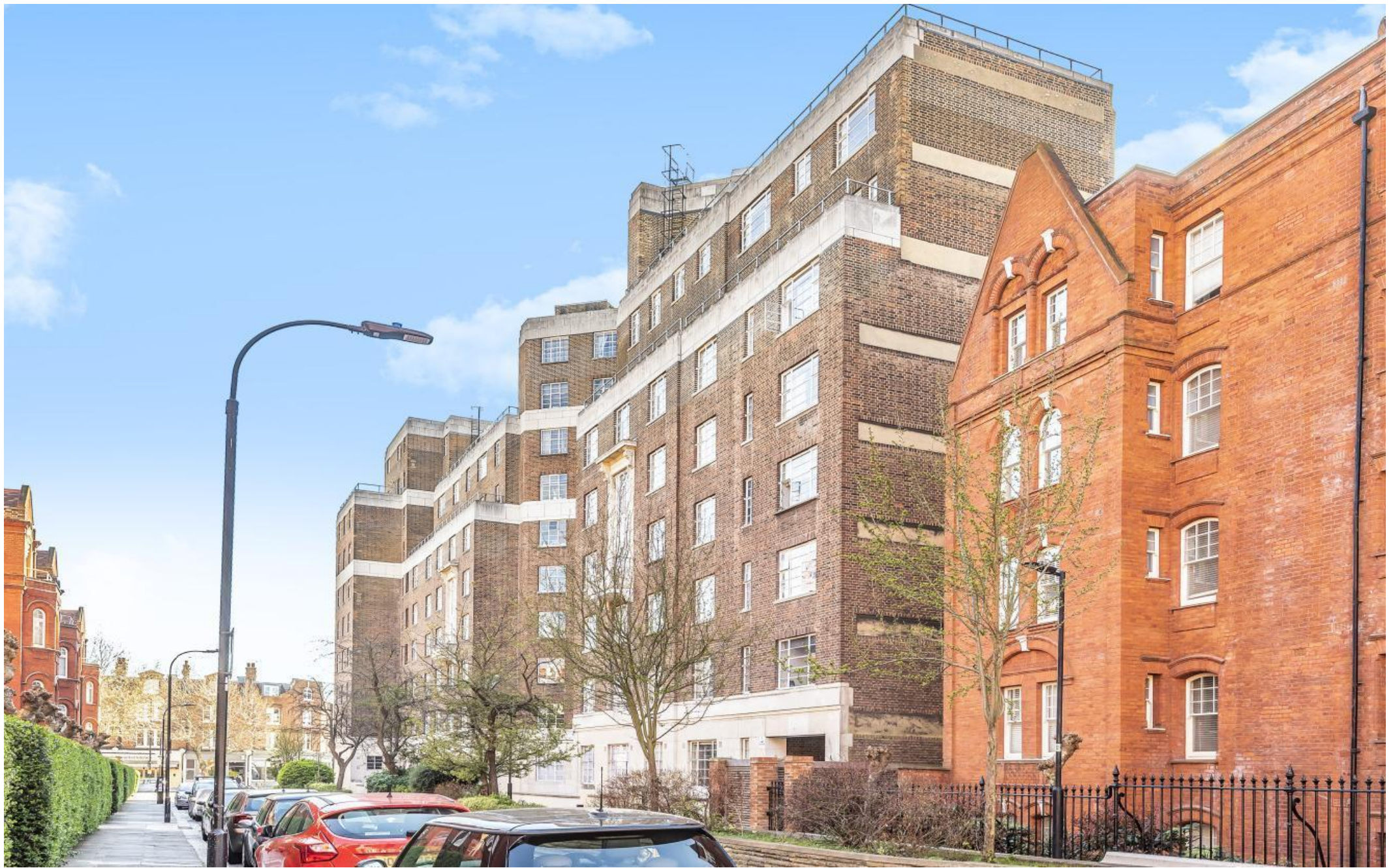
Hamlet Gardens, Hammersmith, W6