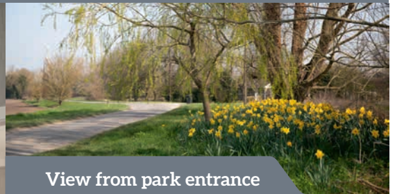
View from park entrance