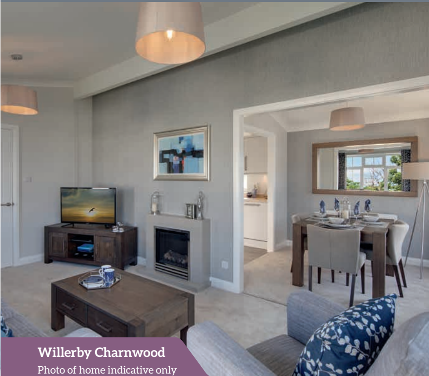
Willerby Charnwood Photo of home indicative only