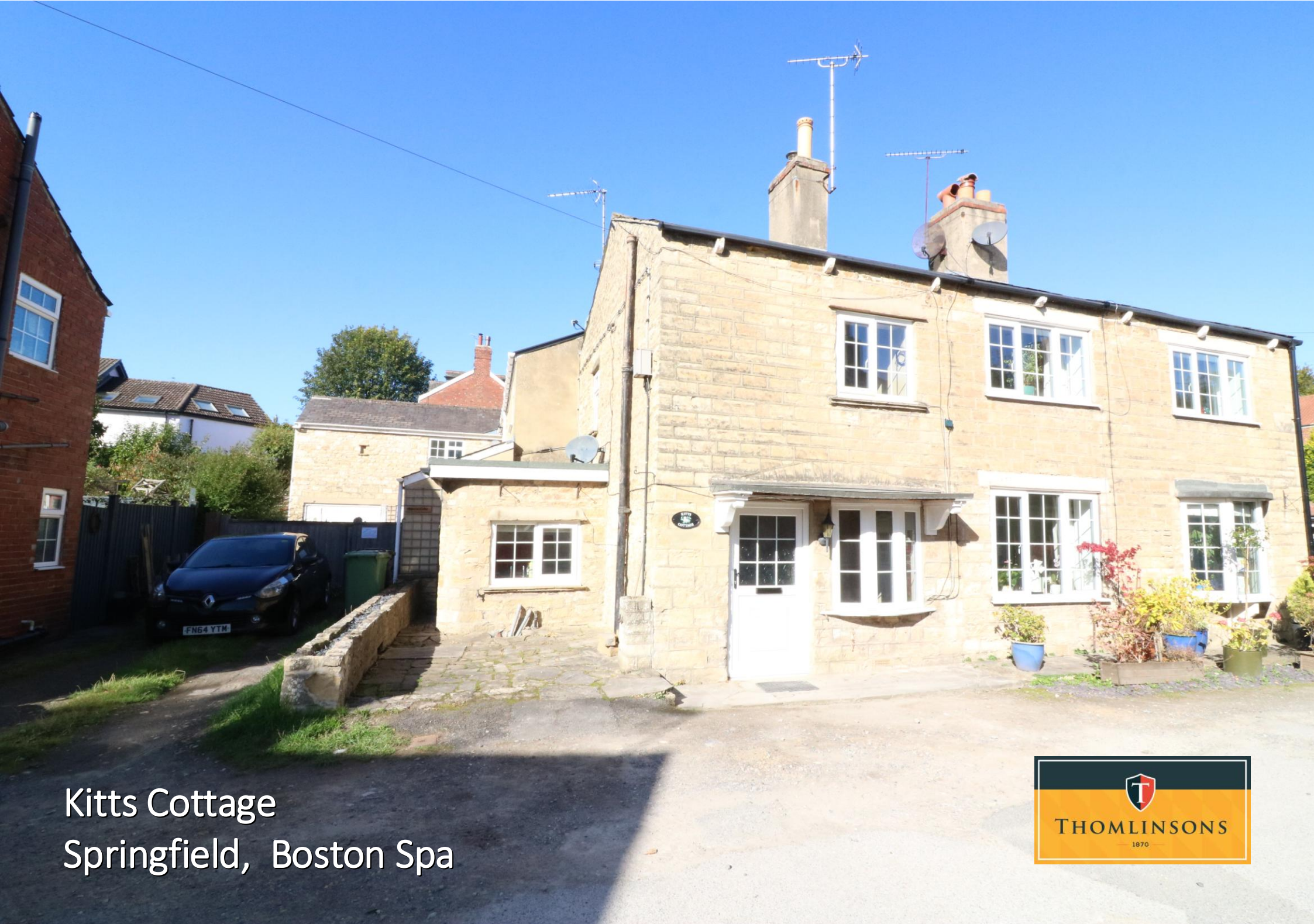
Kitts Cottage Springfield, Boston Spa