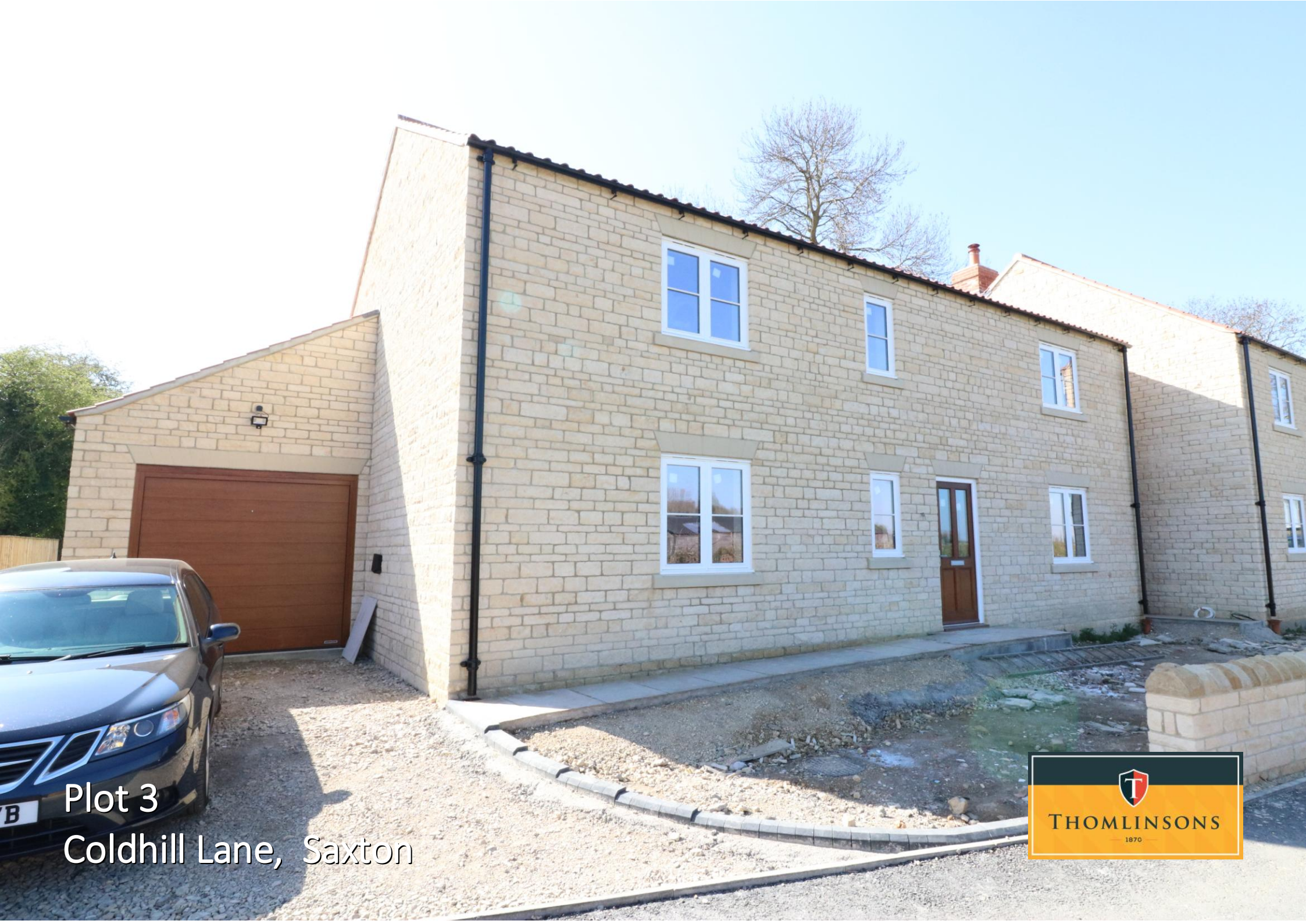
Plot 3 Coldhill Lane, Saxton