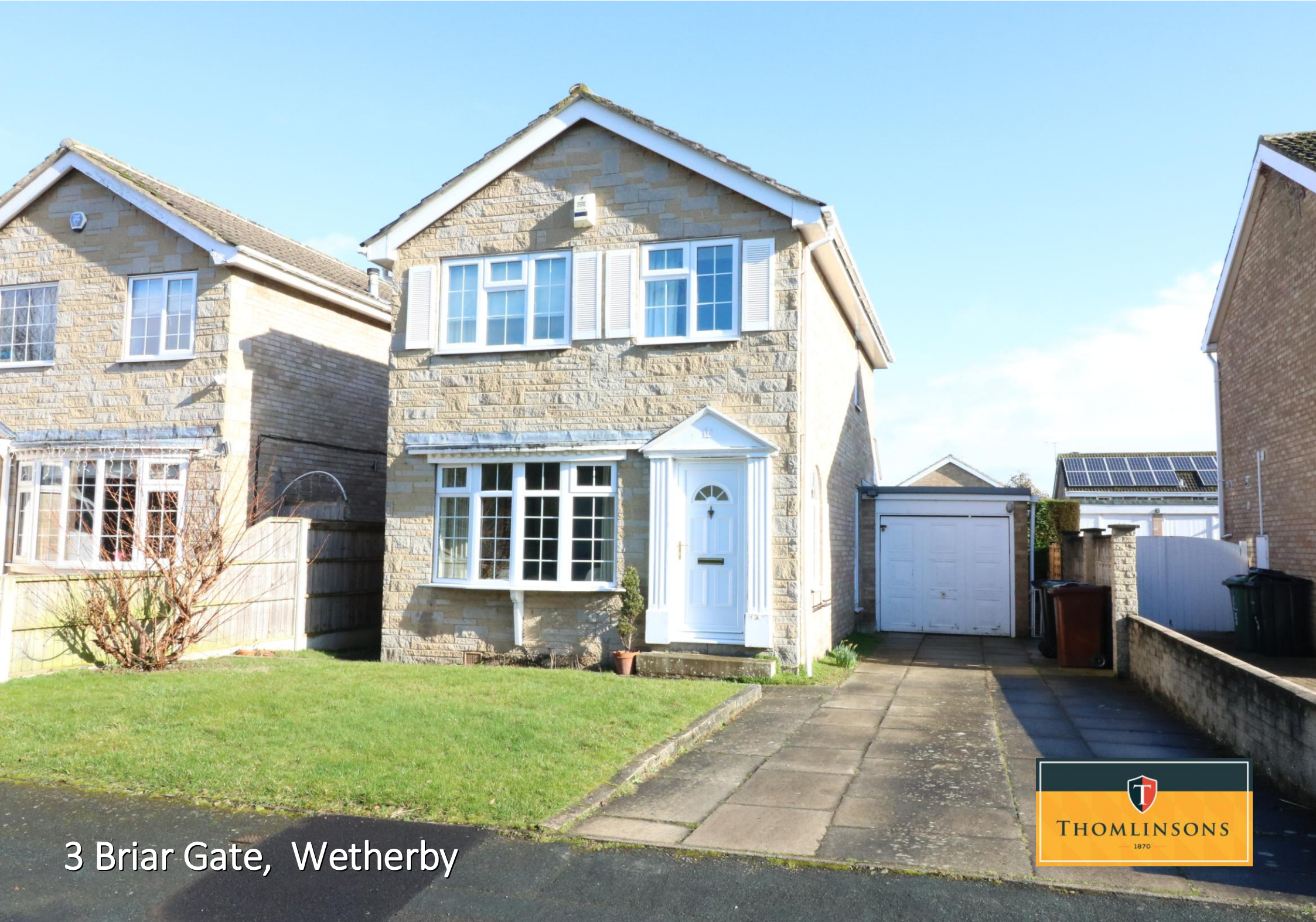
3 Briar Gate, Wetherby