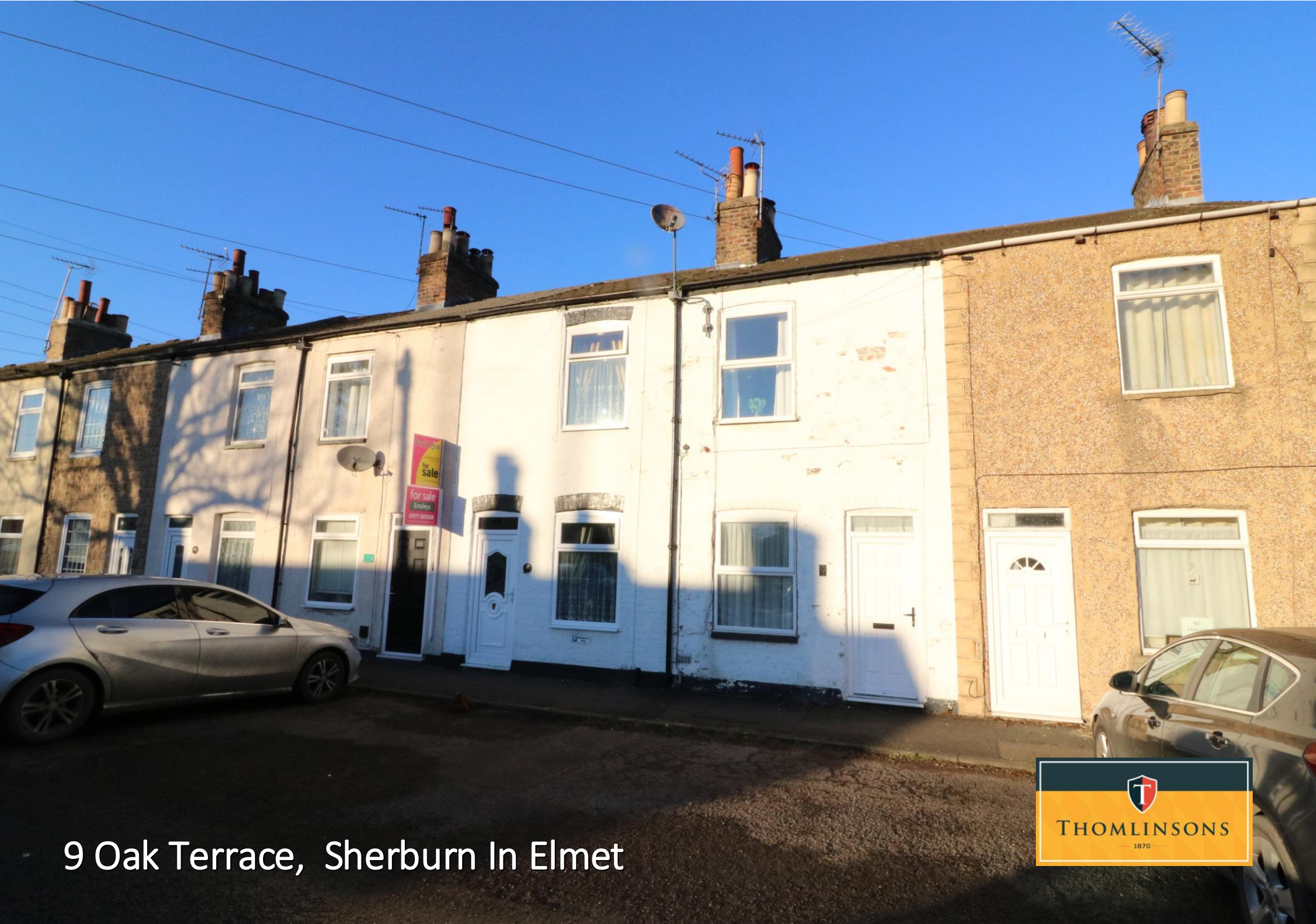
9 Oak Terrace, Sherburn In Elmet

Oak Terrace, Sherburn In Elmet, Leeds, LS25 Approximate Area = 614 sq ft / 57 sq m For identification only - Not to scale