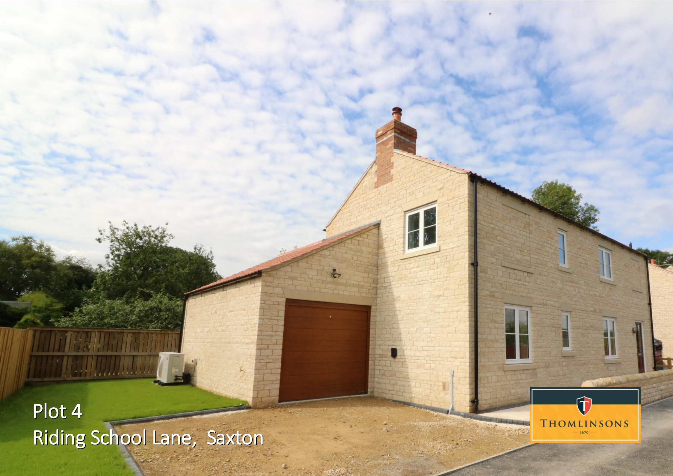
Plot 4 Riding School Lane, Saxton