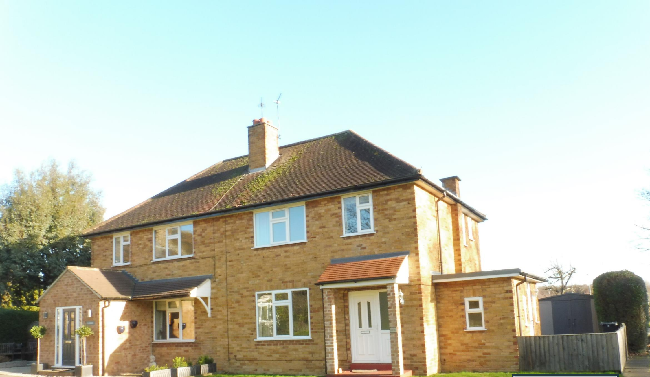
Forsythia Thorp Arch Grange