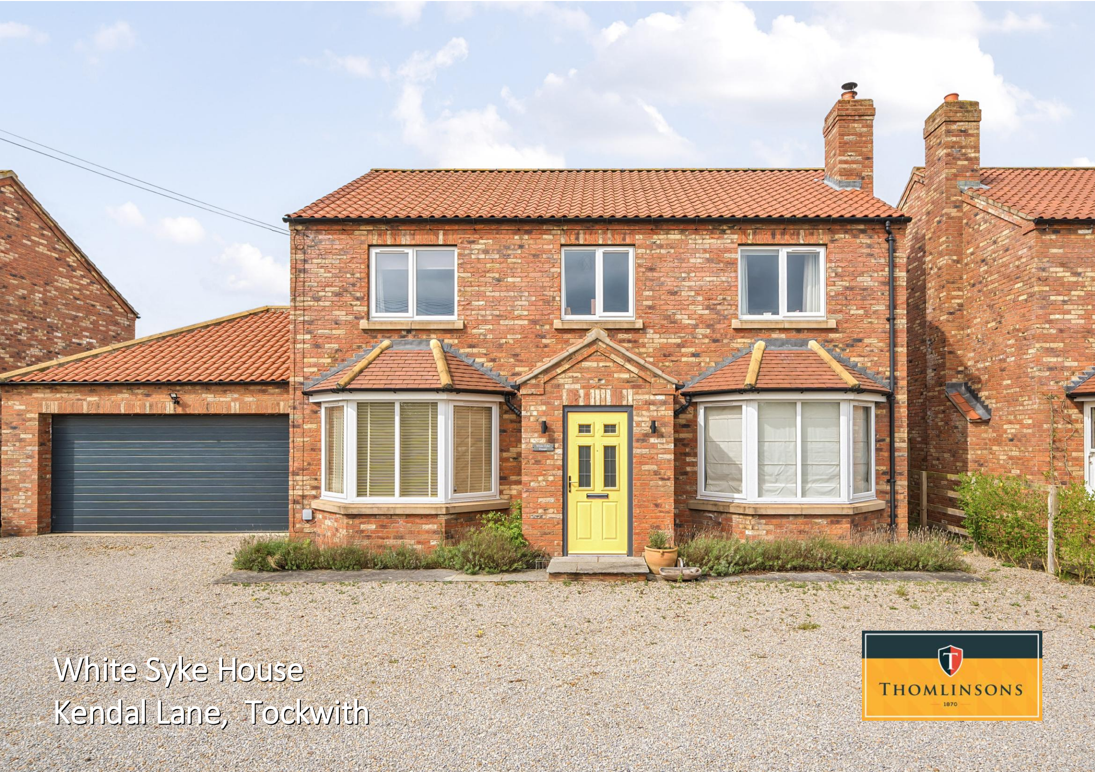
White Syke House Kendal Lane, Tockwith

White Syke House, Kendal Lane, Tockwith, York, YO26