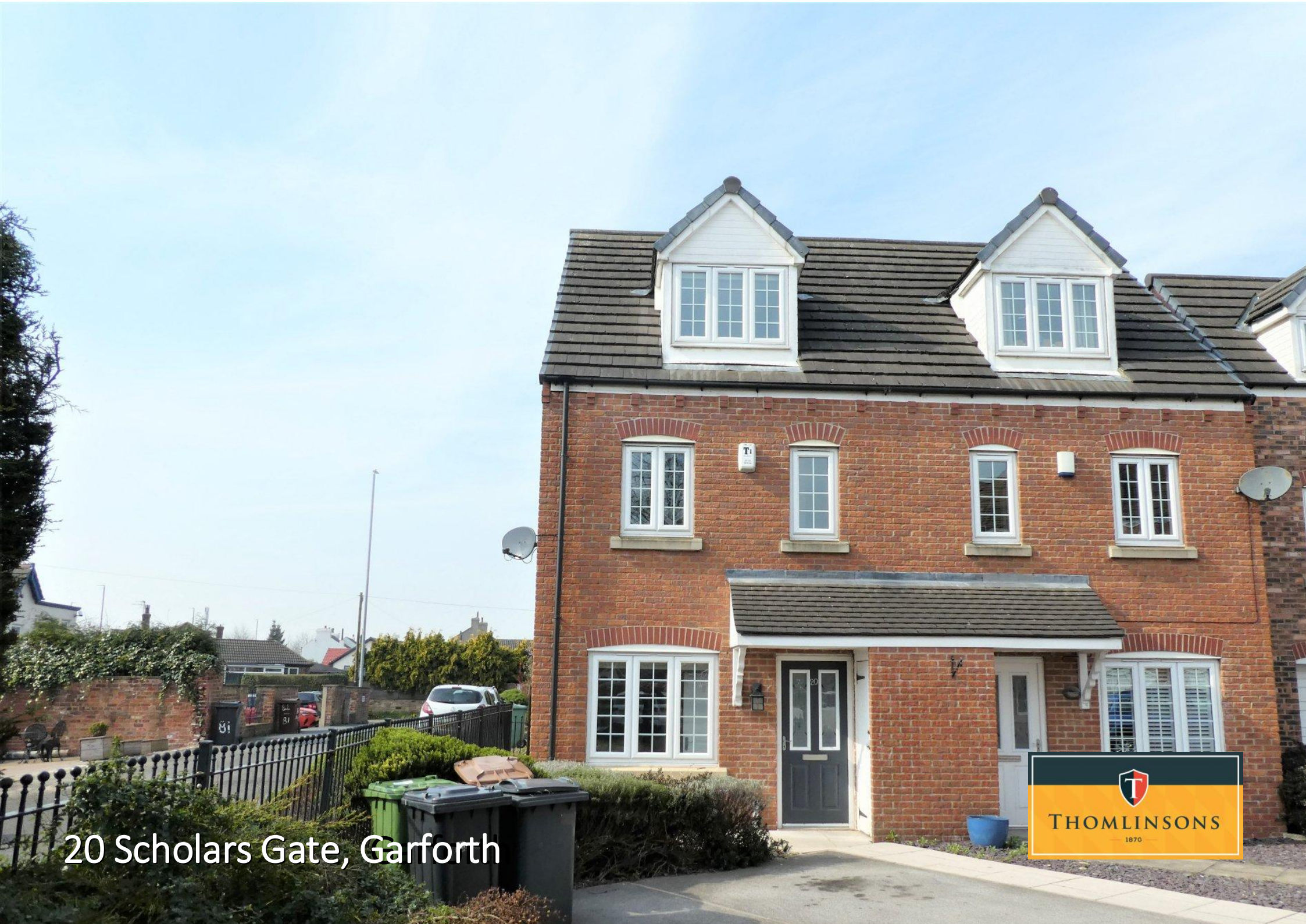
20 Scholars Gate, Garforth