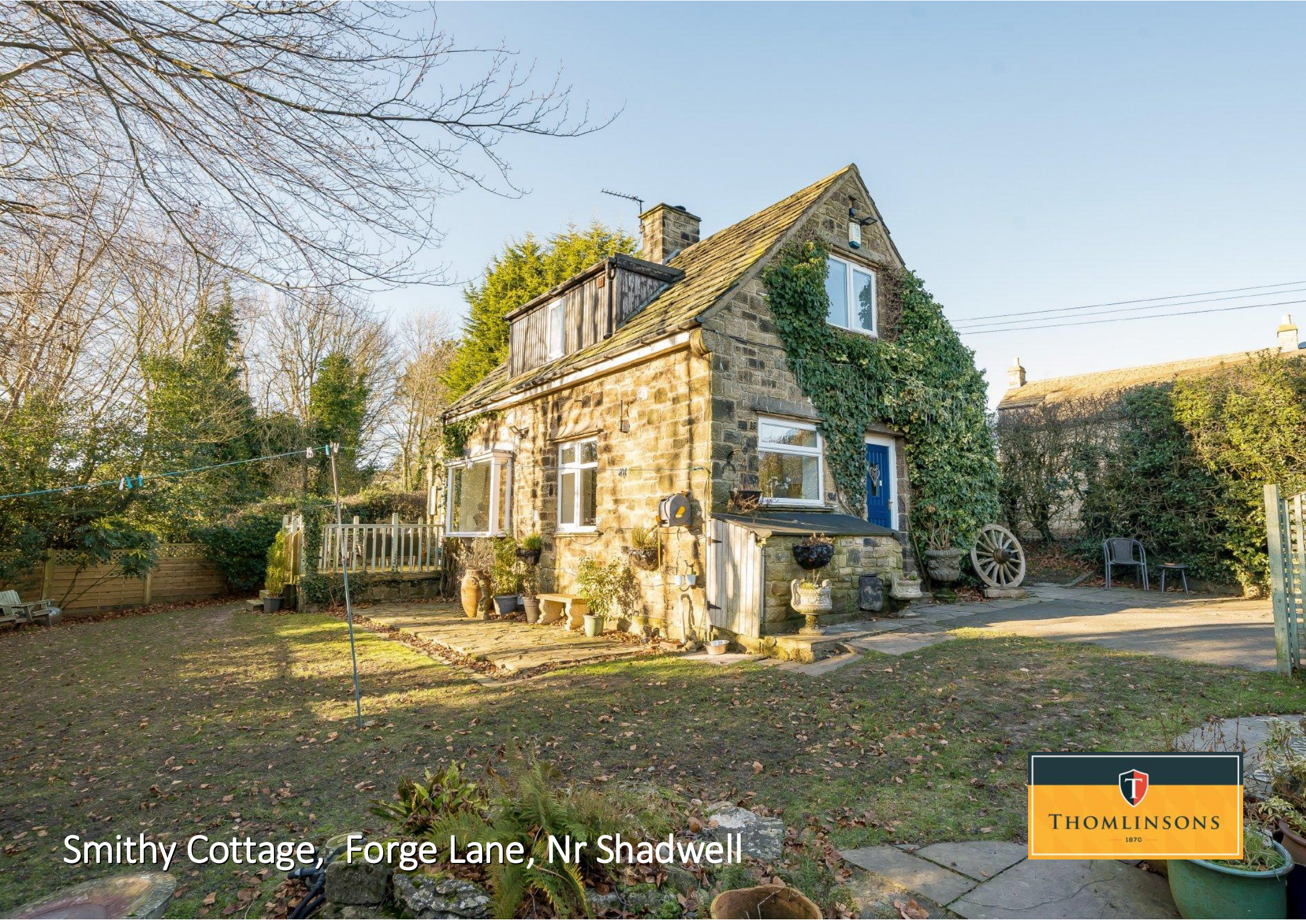
Smithy Cottage, Forge Lane, Nr Shadwell

Smithy Cottage, Forge Lane, Wike, Leeds, LS17 Approximate Area = 724 sq ft / 67.2 sq m Limited Use Area(s) = 85 sq ft / 7.8 sq m Total = 809 sq ft / 75 sq m For identification only - Not to scale Denotes restricted head height