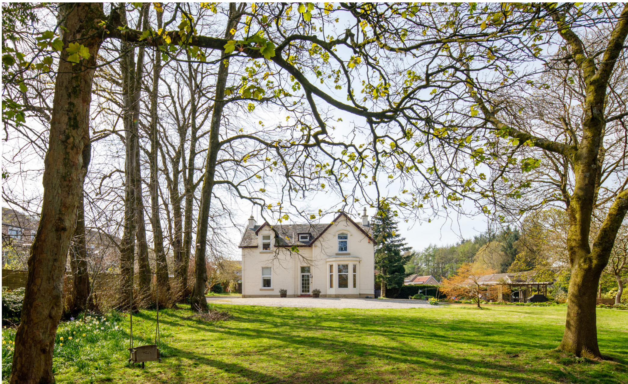
Toft's Cottage, 6 Barr Place, Newton Mearns, G77 6JR