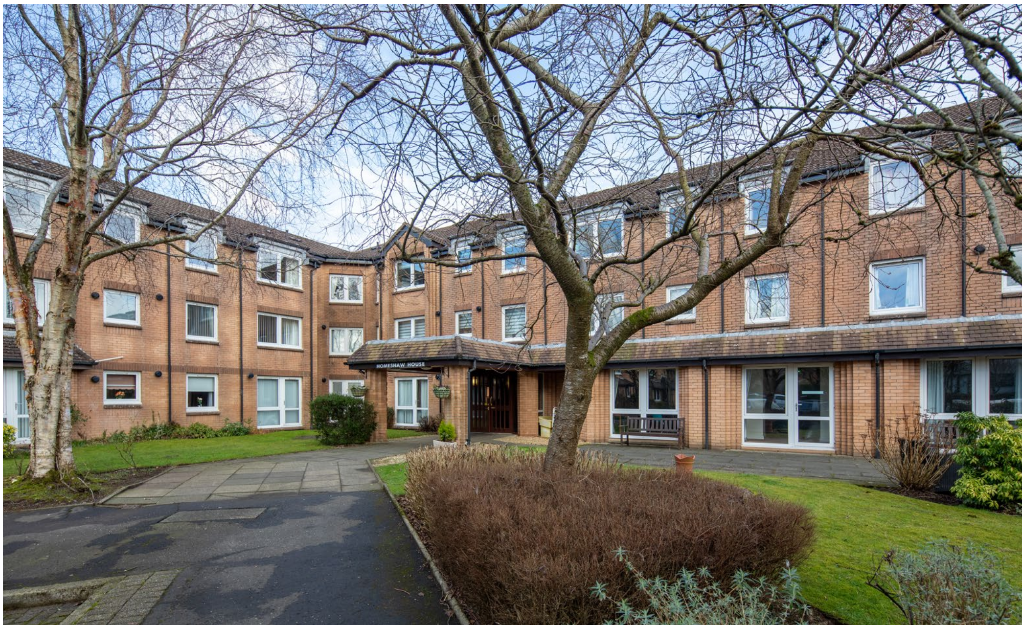
31 Homeshaw House, 27 Broomhill Gardens, Newton Mearns