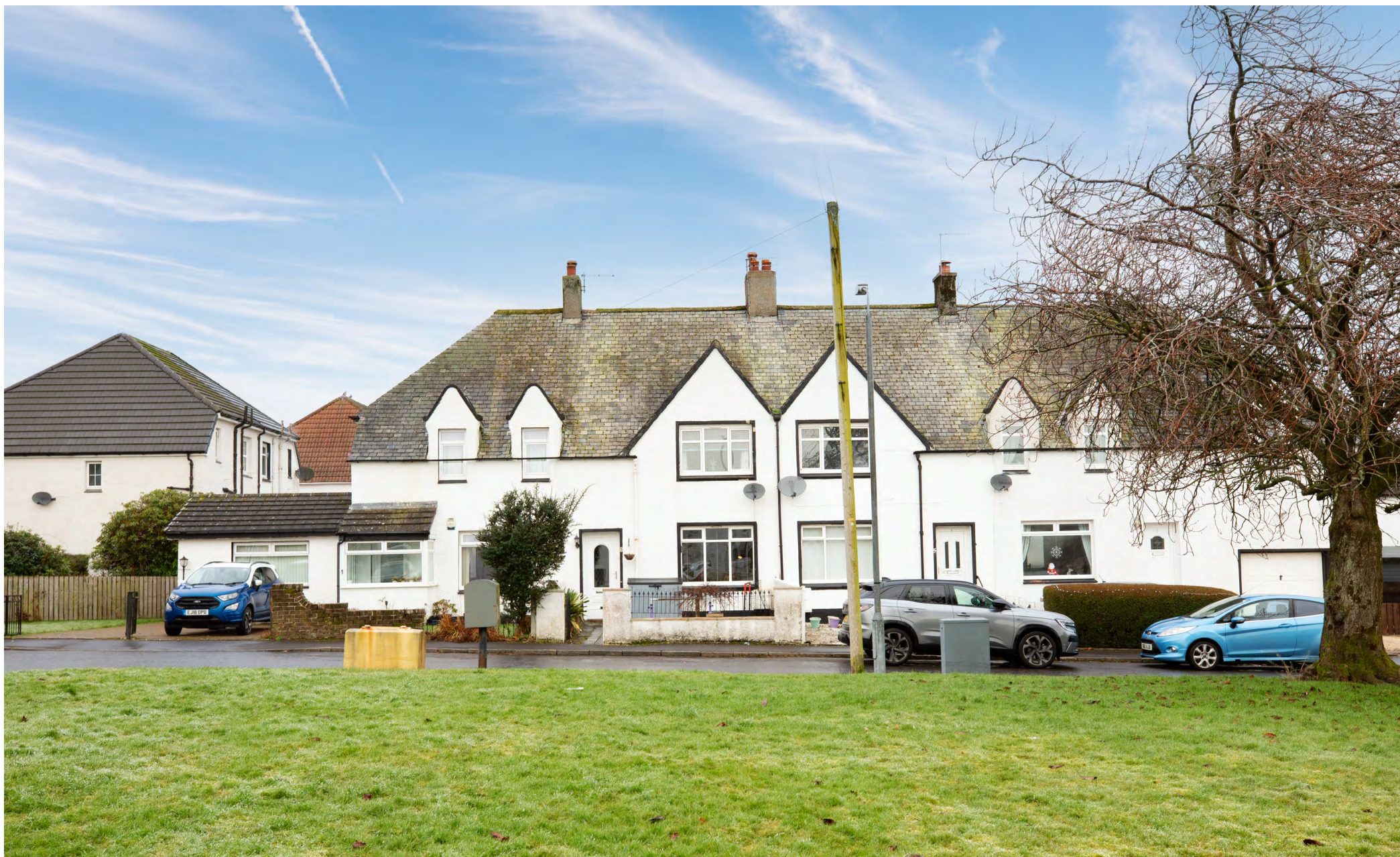
3 Manseview Terrace, Eaglesham