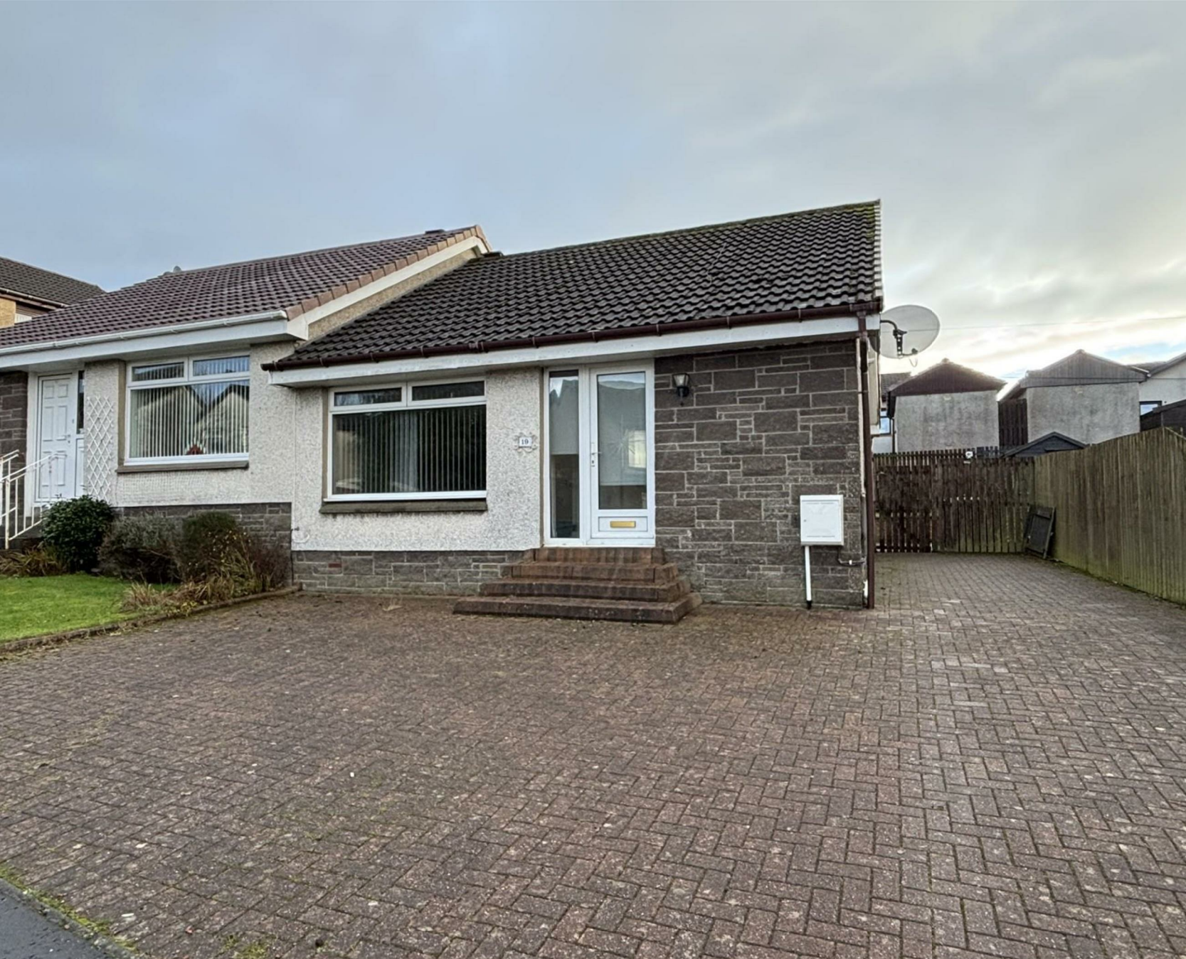
19 Mossbank Crescent, Motherwell, ML1 5TE £850 Per Month