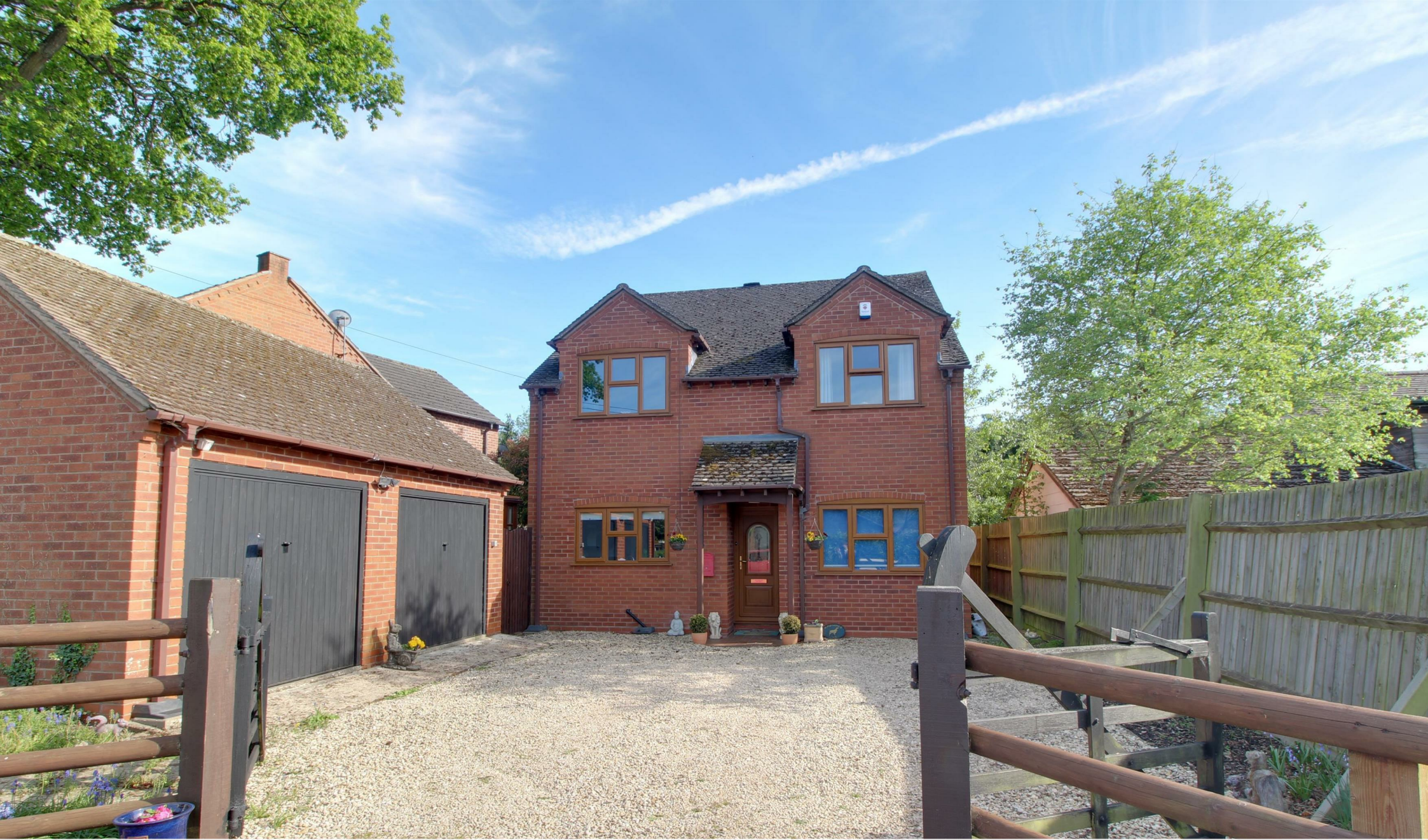
Persephones View Sandfields, Bromsberrow Heath HR8 1NX Guide Price £459,950