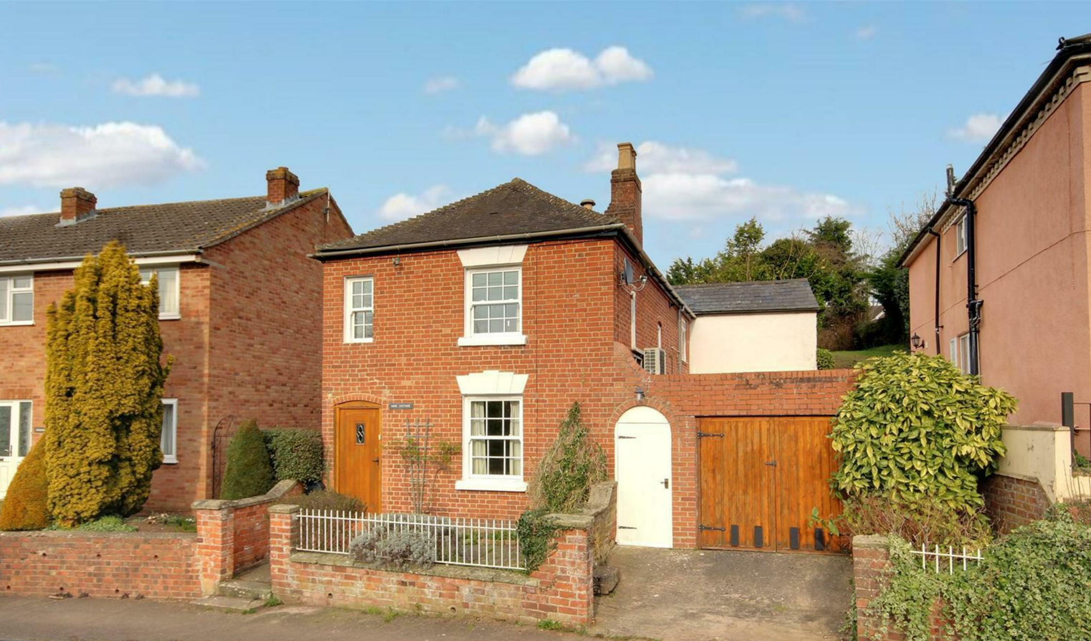
Rose Cottage Bury Bar, Newent GL18 1PT £450,000