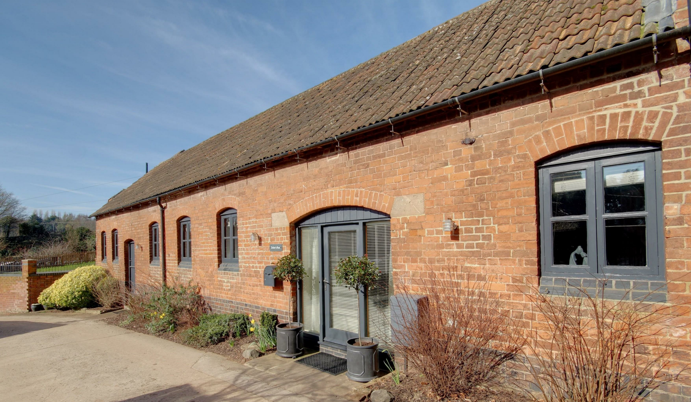
The Scarr, Newent GL18 1DQ Guide Price £450,000