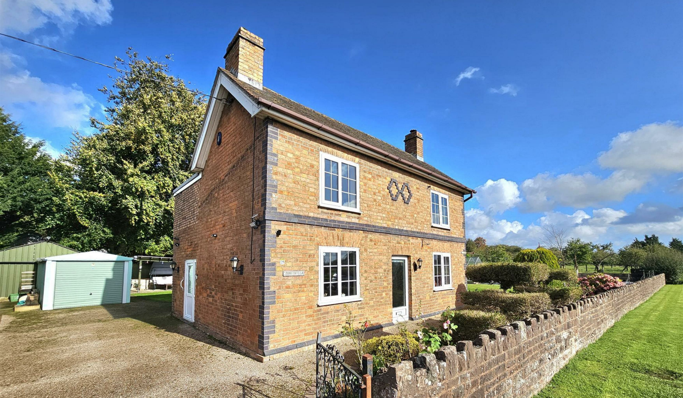
Duni Villa , Gloucester GL2 8JP £399,950