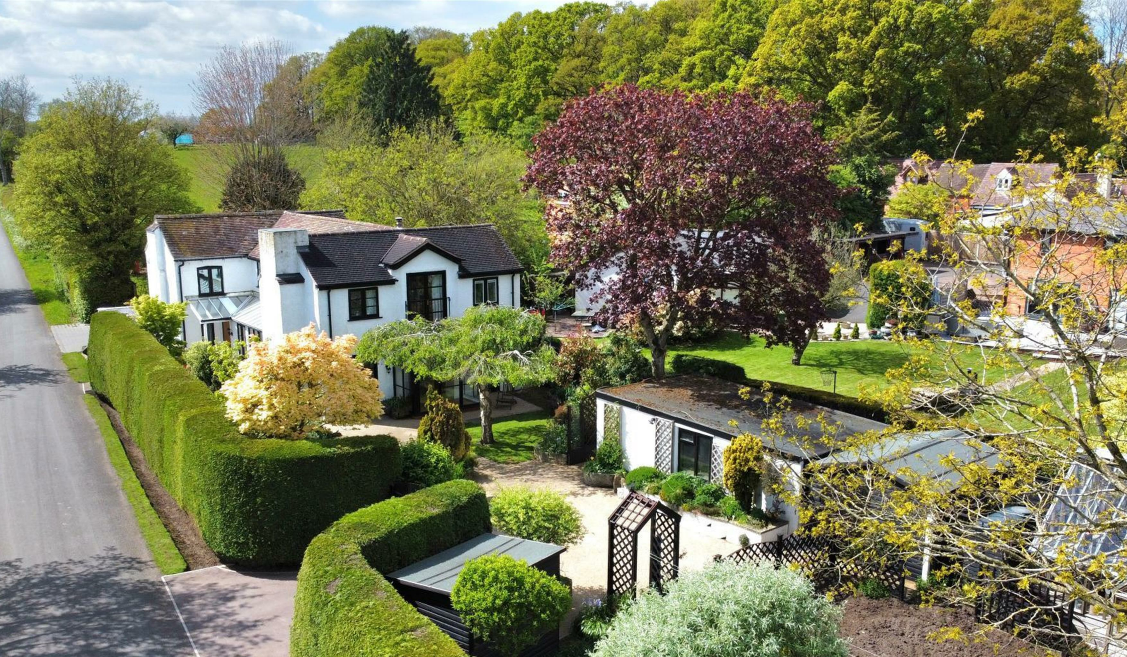
Hook Cottage Hooks Lane, Newent GL18 1EL Guide Price £550,000