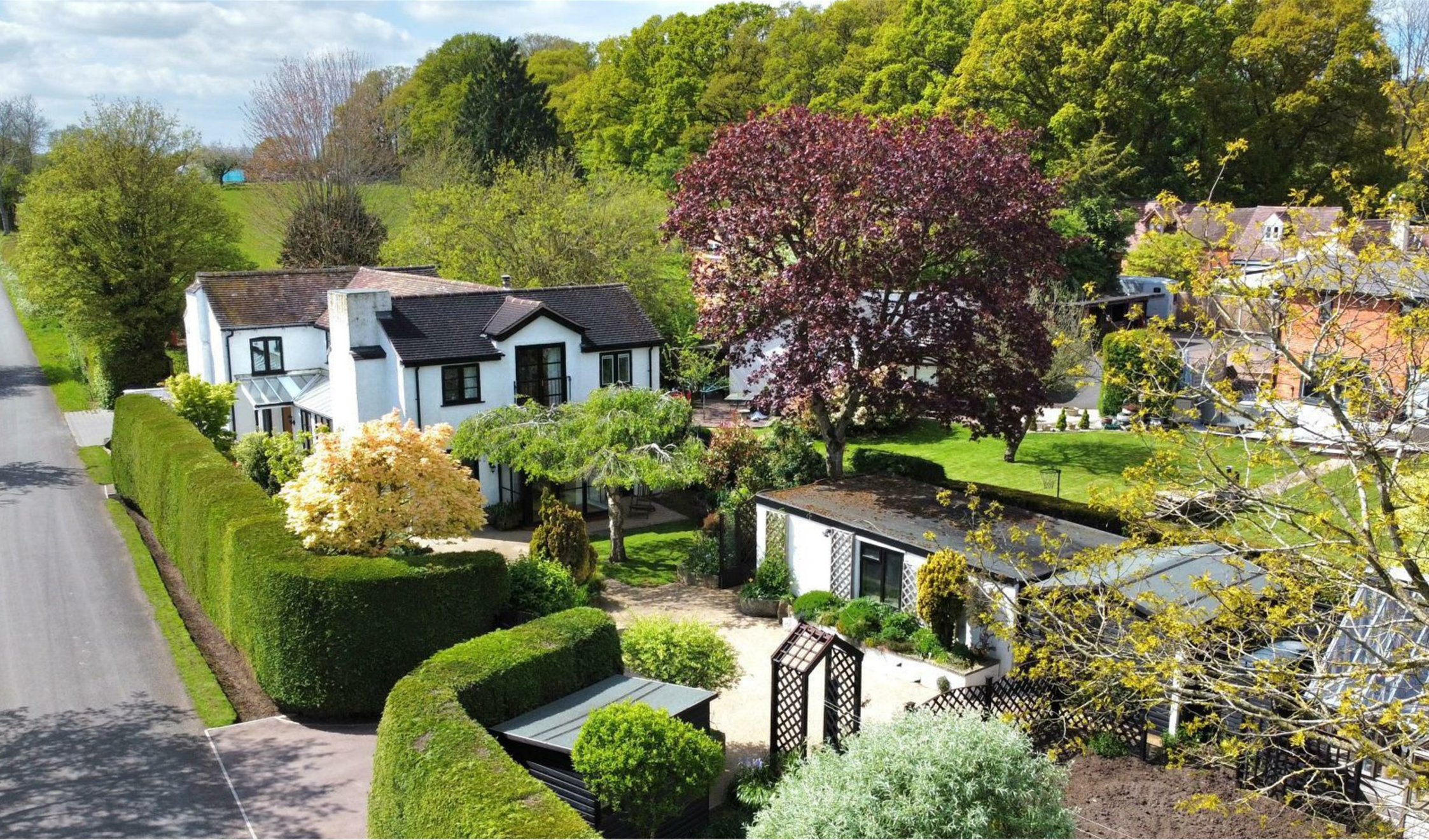
Hook Cottage Hooks Lane, Newent GL18 1EL Guide Price £550,000