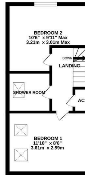
1ST FLOOR 289 sq.ft. (26.8 sq.m.) approx.