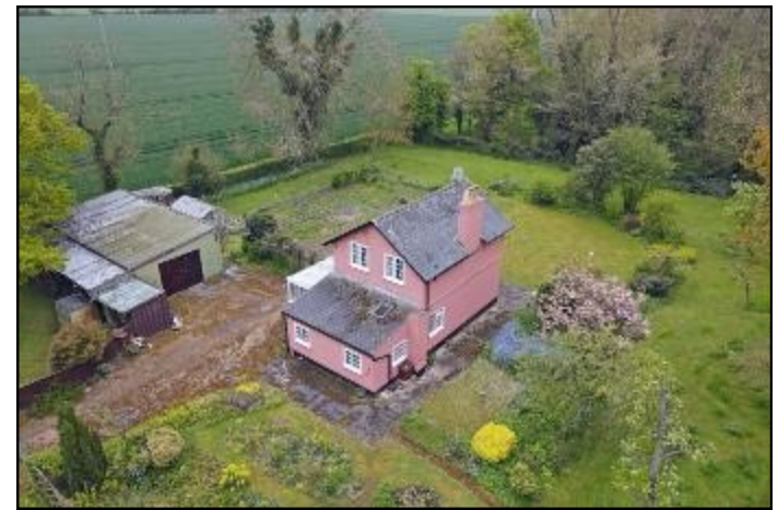
Red Cottage Farm, Clay Hills Road, Kelsale, Saxmundham. IP17 2PR