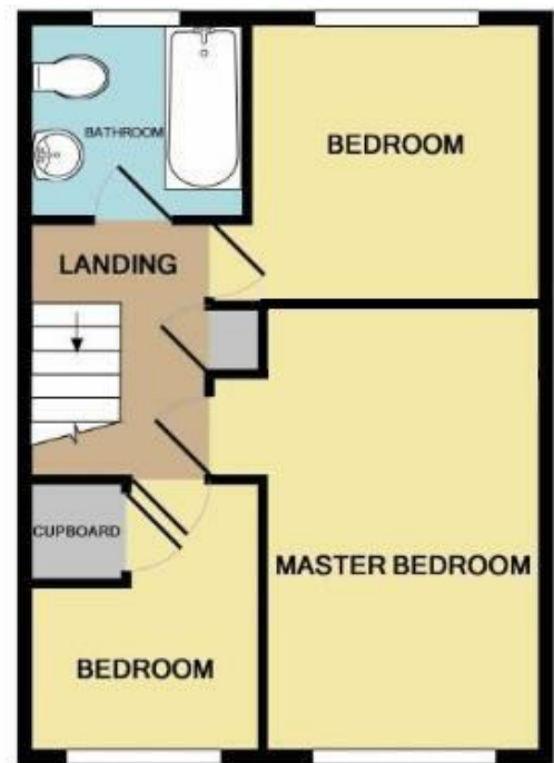
1ST FLOOR APPROX. FLOOR AREA 394 SQ.FT. (36.6 SQ.M.)

TOTAL APPROX. FLOOR AREA 1072 SQ.FT. (99.6 SQ.M.)