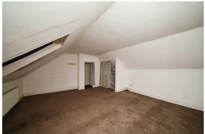
Bedroom five 17'4" x 16'7" maximum (5.30 x 5.06 maximum )

Rooty window, central heating radiator, built-in storage and carpeted flooring.