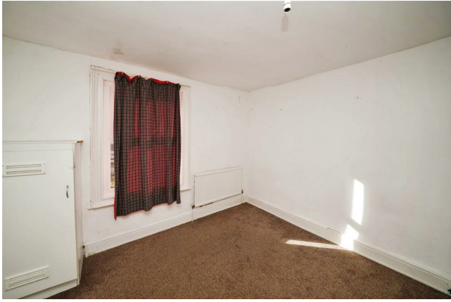
Bedroom three 3.89 x 3.46

UPVC double glazed window, central heating radiator, feature fireplace, fitted storage cupboard and carpeted flooring.