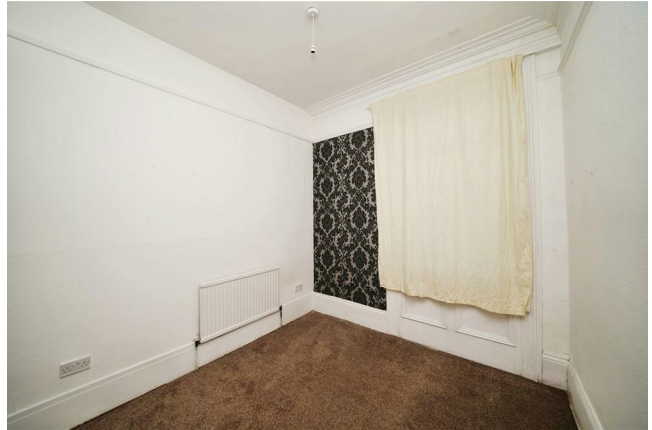
Bedroom four 9'7" x 8'11" (2.94 x 2.72 )

UPVC double glazed window, central heating radiator and carpeted flooring.