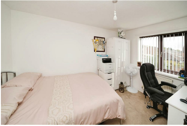
Bedroom Two 11'7 x 8'0 (3.53m x 2.44m)

UPVC double glazed window to the front elevation and a gas central heating radiator.