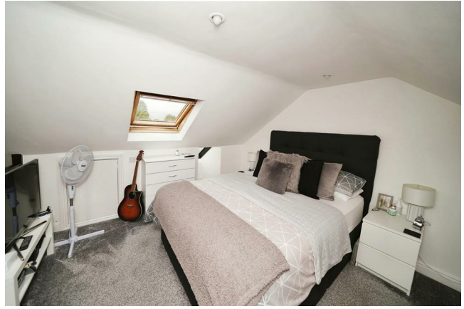
Bedroom Three 12'9 x 13'8 (3.89m x 4.17m)

Two double glazed roof windows, fitted wardrobes and access to the eaves.