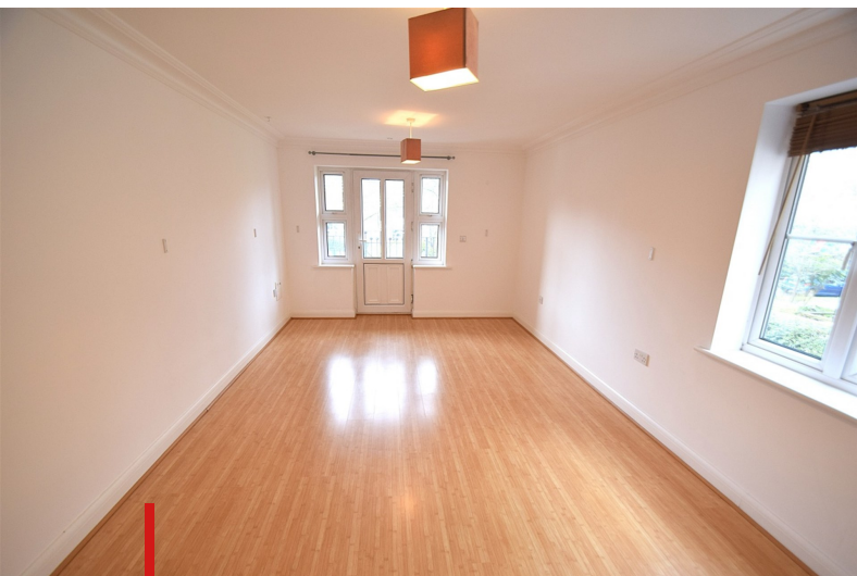
FLAT 4 ARMFIELD HOUSE HIGHFIELD Hampshire, SO17 1AJ