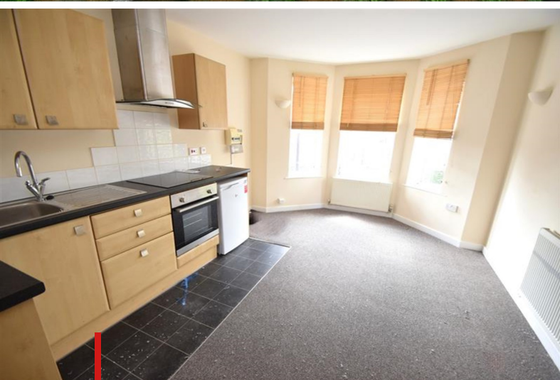
FLAT 3/CHARMERE BITTERNE Hampshire, SO18 1GS