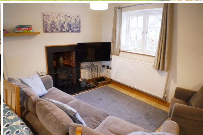
BUTTERCUP COTTAGE REDLYNCH Wiltshire, SP5 2HY