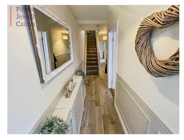
For more photos please see www.pjchomes.co.uk