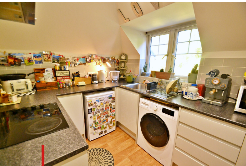
FLAT 9, CHAPEL COURT ASHLEY CROSS Dorset, BH14 0JU