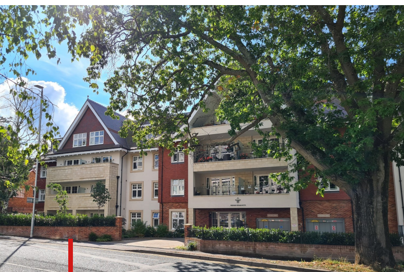
APARTMENT 8 RENAISSANCE POOLE PARK Dorset, BH14 8AQ