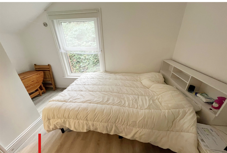
STUDIO FLAT BOURNEMOUTH Dorset, BH1 1PE