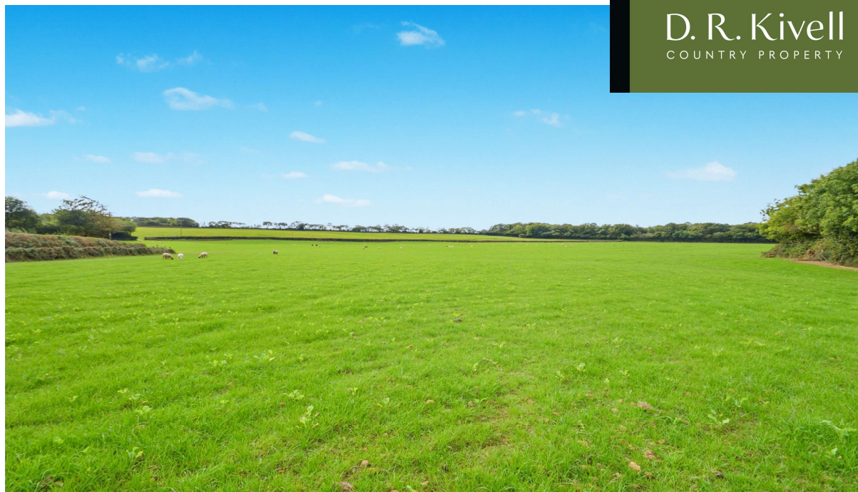
Photographs taken 2014