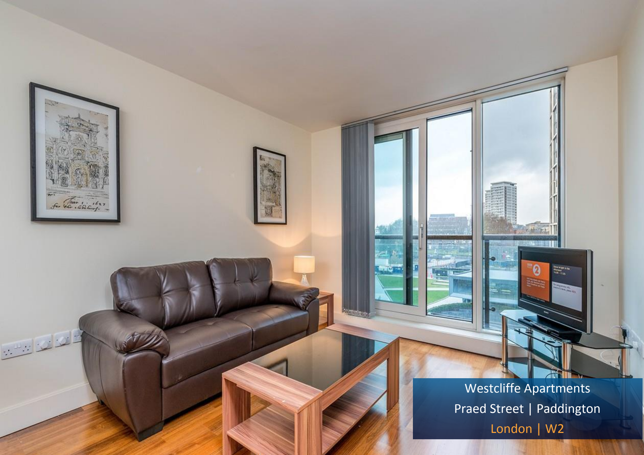
Westcliffe Apartments Praed Street | Paddington London | W2