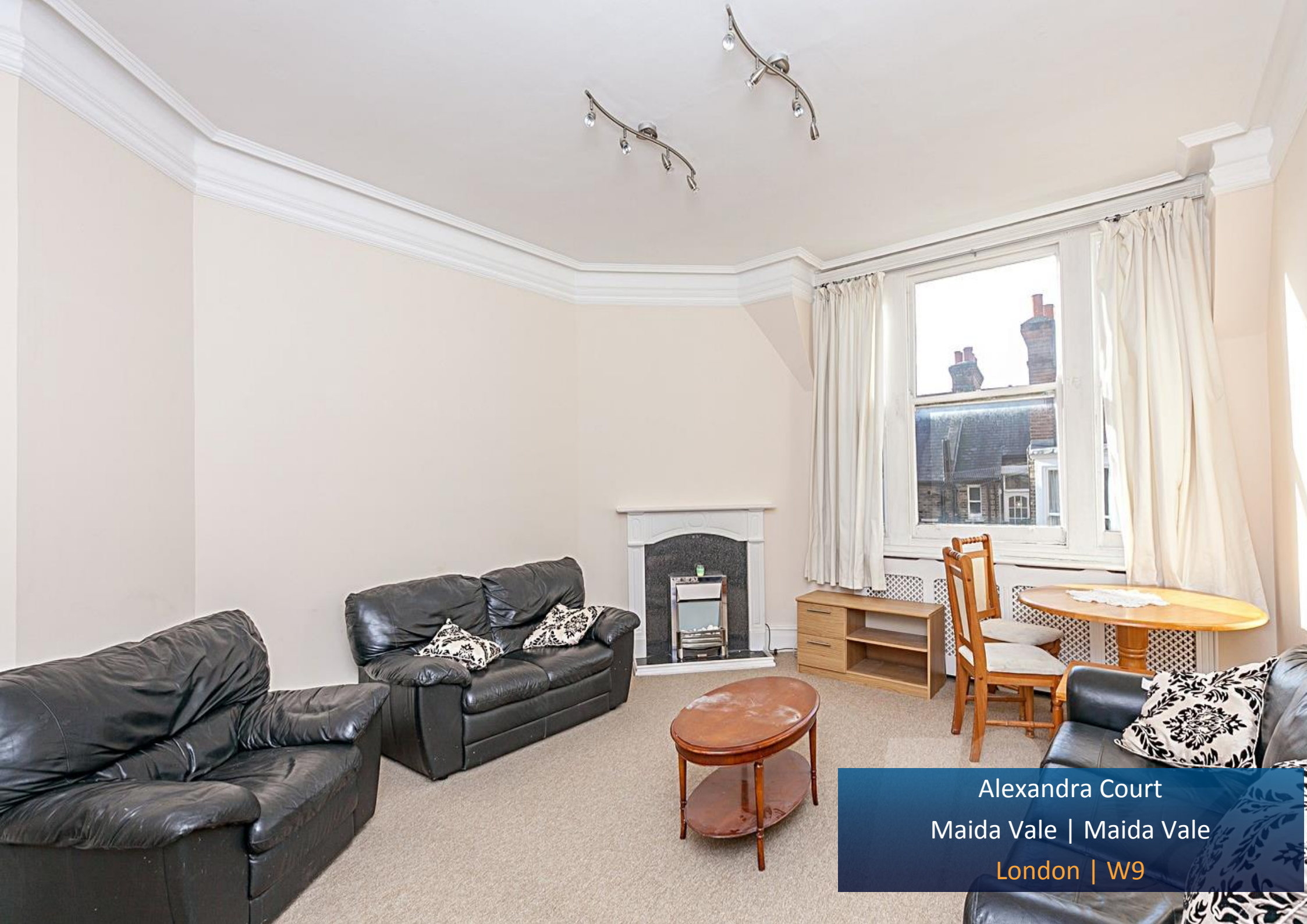
Alexandra Court Maida Vale | Maida Vale London | W9