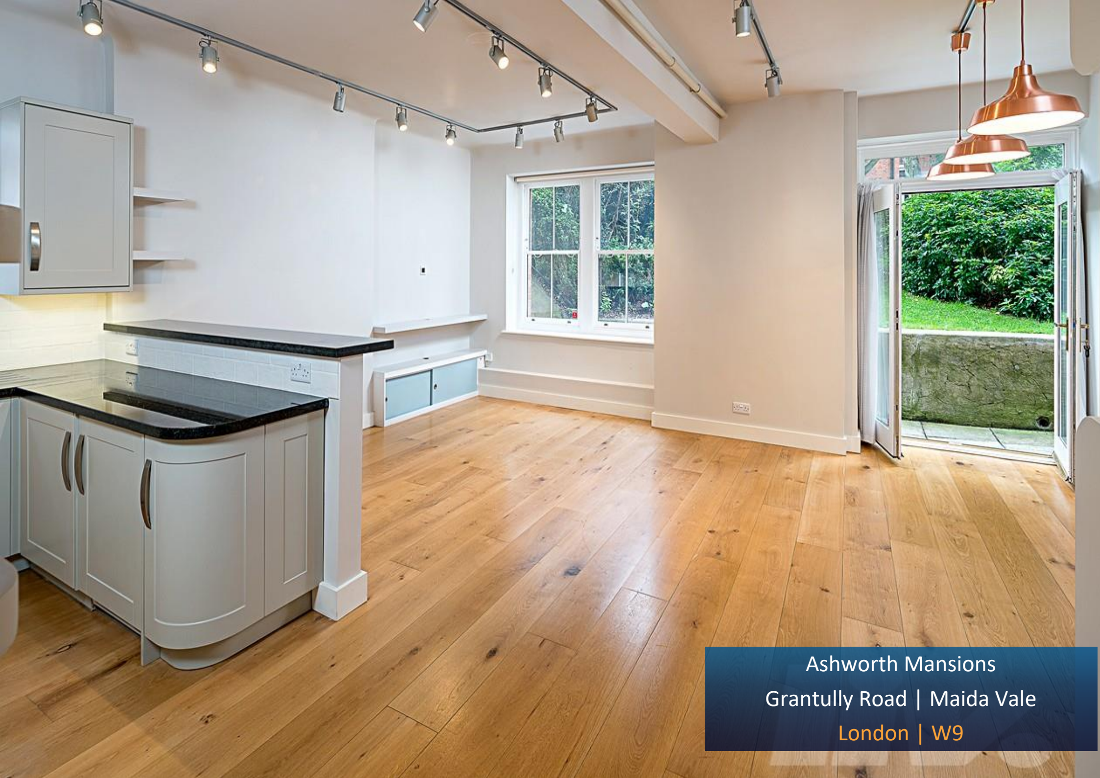
Ashworth Mansions Grantully Road | Maida Vale London | W9