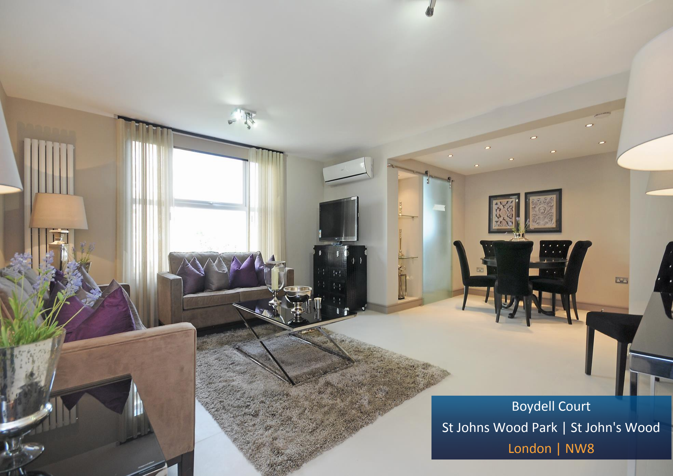
Boydell Court St Johns Wood Park | St John's Wood London | NW8