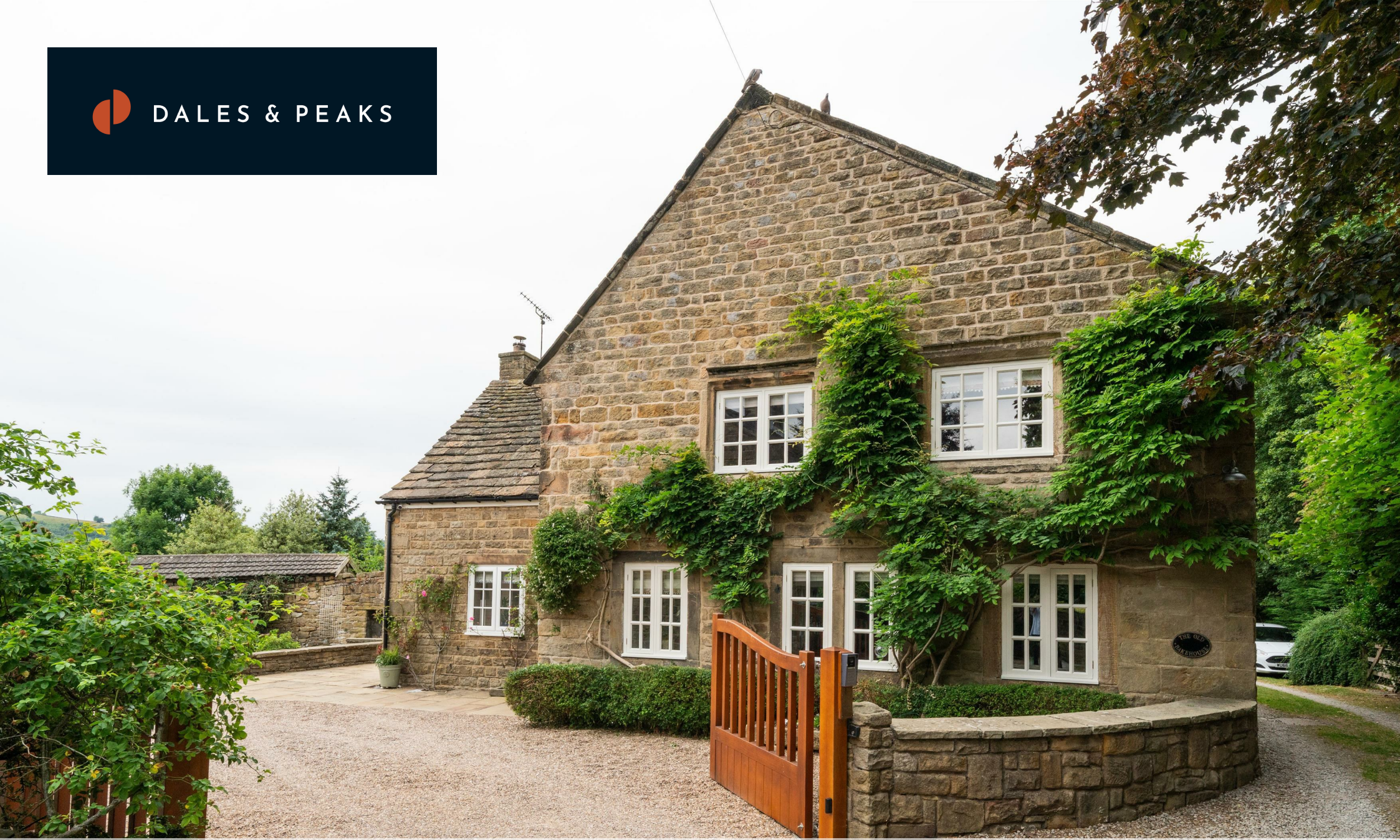
The Old Bakehouse Church Street Ashover, Chesterfield, S45 0AB Offers In The Region Of £950,000