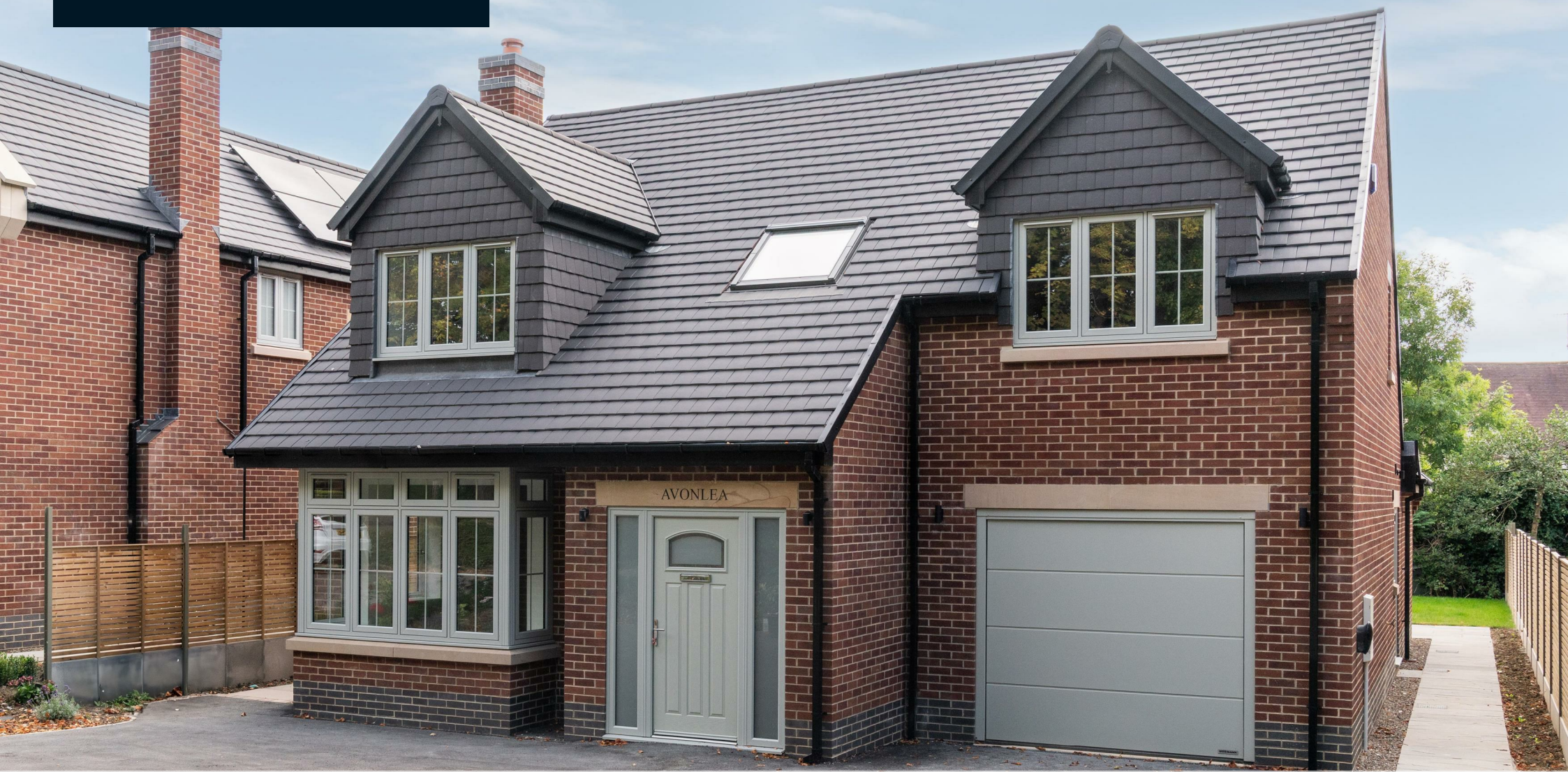
Avonlea Somersall Lane Somersall, Chesterfield, S40 3LA Guide Price £800,000